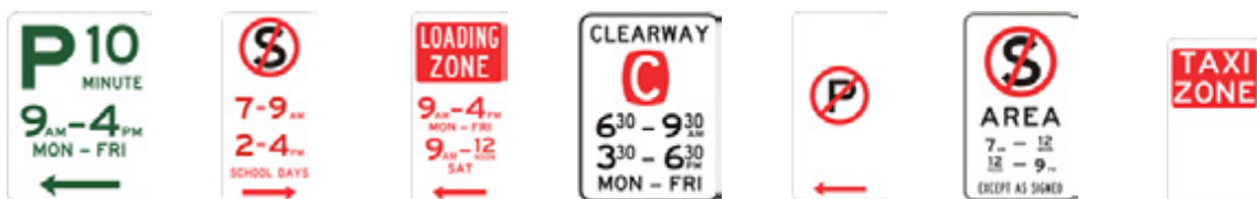
Parking sign, No stopping sign, Loading zone sign, Clearway sign, No parking sign, No stopping area sign, Taxi zone sign

Regulatory signs also include parking zone signs, which let you know where you are allowed to park or stop.