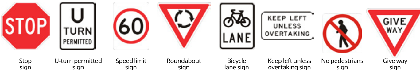
Stop sign, U-turn permitted sign, Speed limit sign, Roundabout sign, Bicycle lane sign, Keep left unless overtaking sign, No pedestrians sign, Give way sign

These signs inform you of traffic laws and regulations – you must obey the instructions on these signs. Regulatory signs come in four distinct shapes: octagons, rectangles, circles, and triangles.